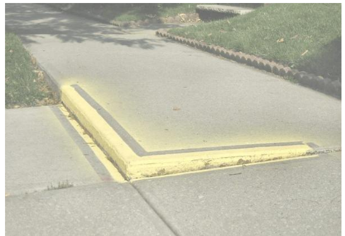
Sidewalk edge painted to warn of tripping hazard.

Before the summer, the city announced a new program that would help homeowners deal with sidewalks that were