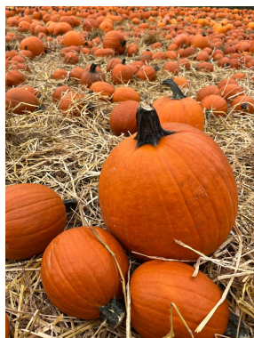
Farm Museum Pumpkin Patch

Halloween on the Farm: Tickets include: The Amazing Maize Maze, DJ dance party, Trick-or-treating with the farm animals! Find nine stations located throughout the farm's 47 acres, Spooky farmhouse experience, Halloween hayrides. Sunday, October 29, 11 am-4 pm. Tickets $20 per person, free ages 3 and under. Online tickets required.