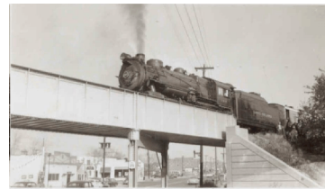
Let's see who remembers...

Last month we published the photo and caption that you see at the left. We received the following letter as a result: