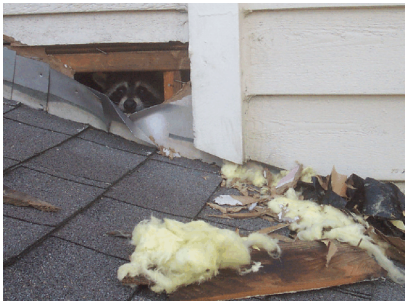
Raccoons are strong. This one ripped a hole in the side of an apartment. They like to hole up in attics. (This photo is not from our neighborhood.)

50 years, we have more wildlife living amongst us than ever before. Raccoons and opossum have become common sightings. It might have to do with the fact that several