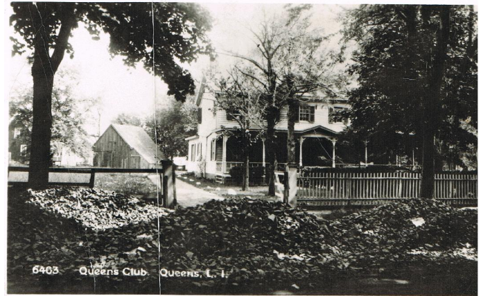
The Queens Club is where the QV Republican Club meet in the from 1936 to 1939 on Jamaica Avenue (Jericho Turnpike) and 215 th St.

The Queens Village Republican Club is the oldest GOP Club in America, founded in 1875. Included here are two photos of the places they met in the early 20 th Century. The Club, which still meets, is perhaps the most vibrant and active Republican Club in Queens today now celebrating 138 years.