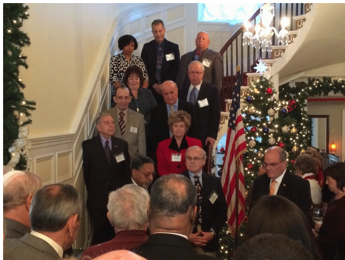
Officers of the Queens Civic Congress line up the stairs at the Douglaston Club to take the oath of office.