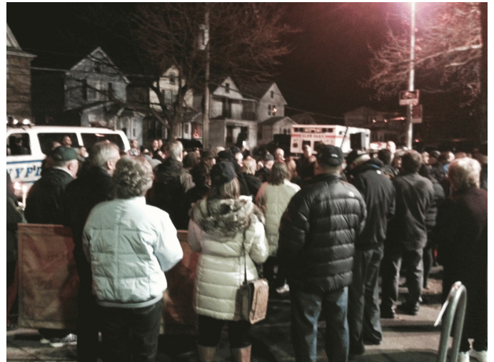
Local residents turn out in front of the 105 Precinct to honor the fallen NYPD cops.

We extend our heartfelt condolences to the officers of the 105 th Precinct on the loss of these exceptional officers and human beings. We also thank you all for your courage and dedication in protecting us every day.