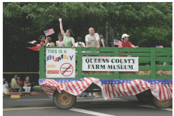
Three members of Creedmoor Civic joined in the observance of Memorial Day by boarding the float of the Queens County Farm Museum on Northern Boulevard in Little Neck-Douglaston.