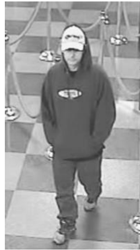
Camera view of perp.

Officers of the 105th Precinct are looking for a suspect wanted in connection with a bank robbery that occurred on Friday, May 18.