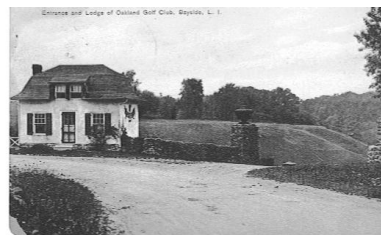
Oakland Golf Course, Bayside