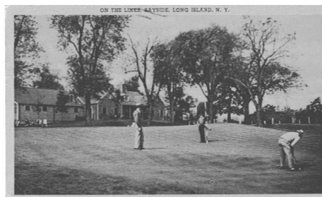
Bayside Links Golf Club