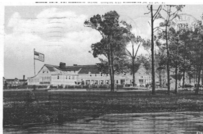
St. Albans Golf Course and lake