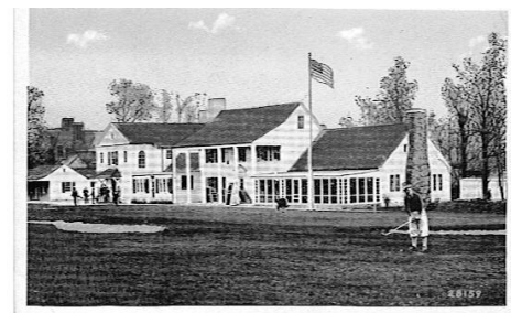
Old Country Golf Club, Flushing

Opened in 1932. Designed by Alister MacKenzie. N: 26 th Avenue., E: 210 th Street. W: 203 rd Street, S: 32 nd Avenue. Gone by 1949. Replaced by homes.