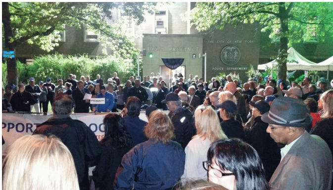
Residents rally in front of the 105 Precinct to show support for the work of the police. This culminated a march through the streets of the neighborhood.