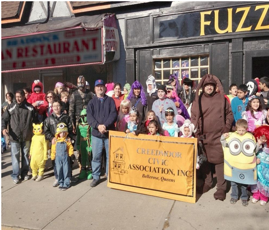
Holding our Civic banner proudly, participants in our free annual Halloween costume parade pose in front of Fuzzy's Bar on Braddock Avenue.

Approximately 70 costumed children and their chaperones marched through the streets of our civic as part of our Creedmoor Civic Association annual Halloween Costume Parade on Saturday, October 26.