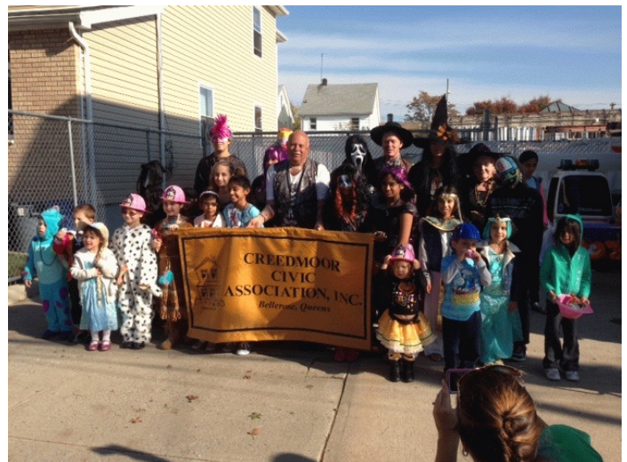
Part of the group of parade participants gather behind the Bellerose Rescue building at the corner of Braddock Avenue and Lyman Street. This parade has been going on for about 20 years and is extremely popular with our residents.